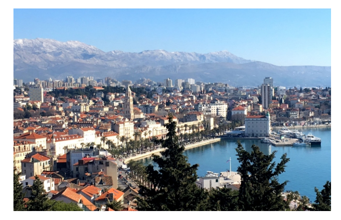
Split, September 27th - 28th, 2018.