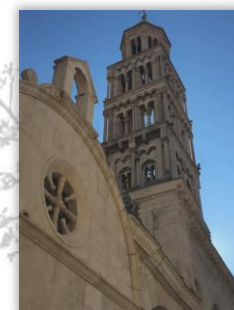
Cathedral of Saint Domnius

MTSM Conference Proceedings are since 2017 indexed in SCOPUS database (Elsevier).